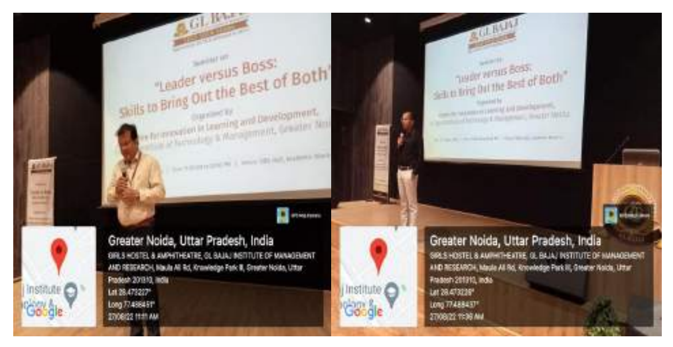
A Report of One Day Seminar on "Leader versus Boss: Skills to Bring Out the Best of Both" dated 27th Aug. 2022

In this regard, Centre for Innovation in Learning and Development (CILD), GL Bajaj ITM Greater Noida organized a seminar on "Leader versus Boss: Skills to Bring Out the Best of Both" dated 27th Aug. 2022. A huge no. of faculty members attended the program.