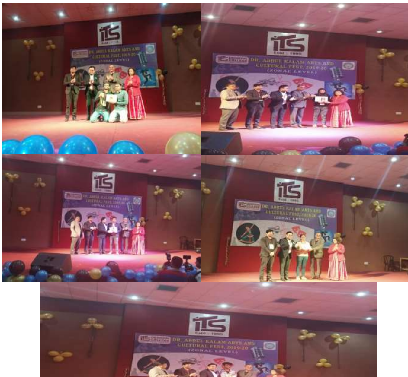
Glimpse of Aktu Fest