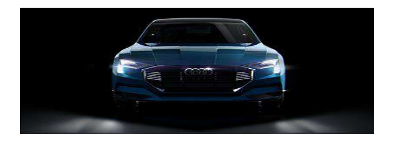
NVIDIA, AUDI Partner to Put World's Most Advanced AI Car on Road by 2020