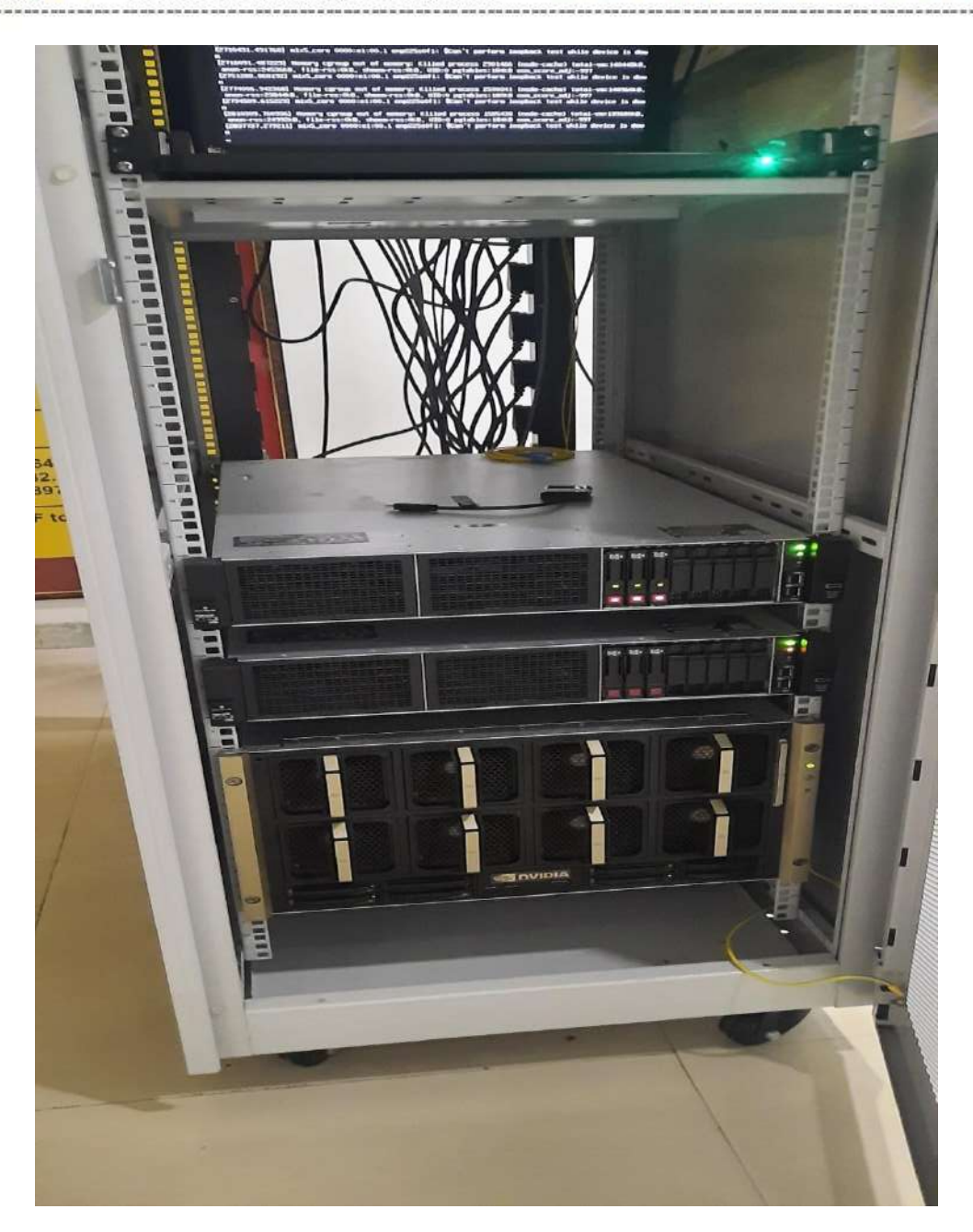
Figure: Server Room

Department Of Computer Science & Engineering